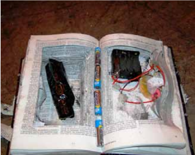
Parcel bomb, Greece

Increased violence in left-wing and anarchist attacks, which has been seen since 2007, persisted in 2010 . In Greece, attacks claimed the lives of six people in 2010. The explosion of a parcel bomb at the Ministry for Citizen Protection on 24 June killed a police officer. On 19 July, a journalist was murdered outside his house. This particularly violent attack involving firearms was claimed by the organisation Sekta Epanastaton and it could be linked to the assassination of a police officer in 2009. Both of these attacks were clearly designed to kill. Despite the fact that left-wing and anarchist extremists generally try to avoid casualties in most of their attacks, a 15-year-old boy died on 28 March when he manipulated an explosive device ostensibly placed to carry out a terrorist attack; his mother and sister were injured. During a demonstration in Athens on 5 May, anarchists caused a fire in a bank, which resulted in the death of three employees.