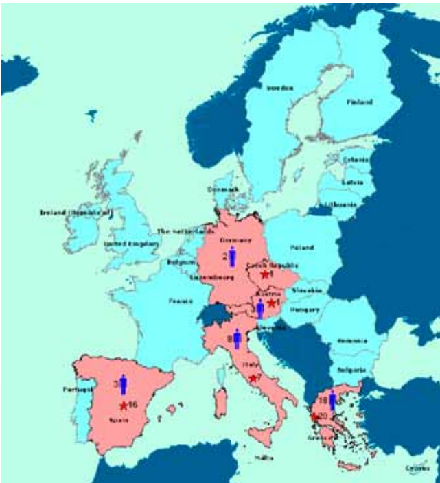
Figure 7: Number of failed, foiled or completed attacks and number of suspects arrested for left-wing and anarchist terrorism in Member States in 2010

Left-wing terrorist groups seek to change the entire political, social and economic system of a state according to an extremist left-wing model. Their ideology is often Marxist-Leninist. The agenda of anarchist terrorist groups is revolutionary and anti-capitalist but also anti-authoritarian.