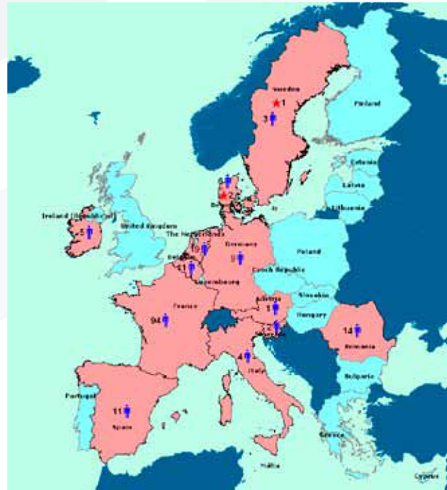
Figure 5: Number of failed, foiled or completed attacks and number of suspects arrested for Islamist terrorism in Member States in 2010

Prophet Muhammad by the Swedish painter, Lars Vilks. A second explosion occurred 10 minutes later, a few streets away from the first explosion. In this case, the suspected suicide bomber himself was the only fatality.