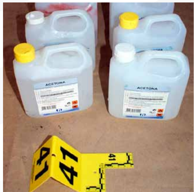
Precursors for home-made explosives, ETA, Portugal

The announcement, in June 2010, of the PKK/KONGRA-GEL intention to enter a more violent period of its history was immediately followed by the declaration of a cease-fire which was, in turn, belied by the bomb attack in Istanbul in October 2010. No execution of attacks in the EU show the PKK/KONGRA-GEL's double strategy of armed struggle in Turkey while at the same time seeking to gain a greater degree of legitimacy abroad. It is assumed that the organisation will continue to follow this double strategy. The terrorism threat posed by the PKK/KONGRA-GEL to EU Member States and the intention can currently be considered as relatively low. However the large number of PKK/KONGRA-GEL militants living in the EU and the continuing support activities in the EU, like large demonstrations organised in the past, show that the PKK/KONGRA-GEL is in a position to mobilise its constituency at any time and is an indication that it maintains the capability to execute attacks in the EU.